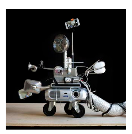
A Device for Hearing Empathy