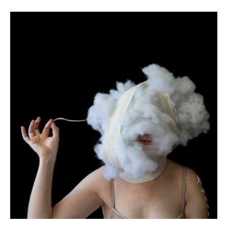
A Device to Forget