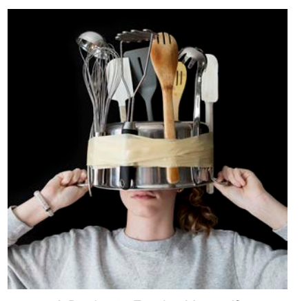
A Device to Forgive Yourself for All the People You Have Wronged