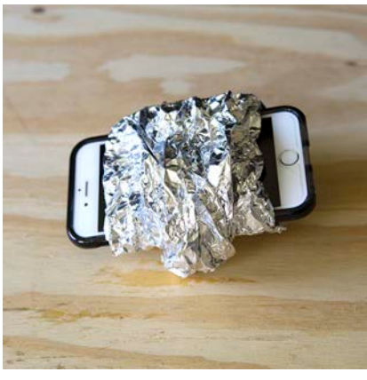
A Device for Navigating Political Differences