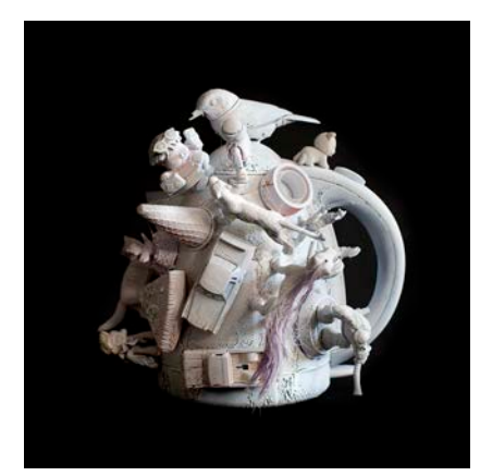
A Device for Time Expansion