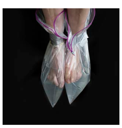
A Device to Heal