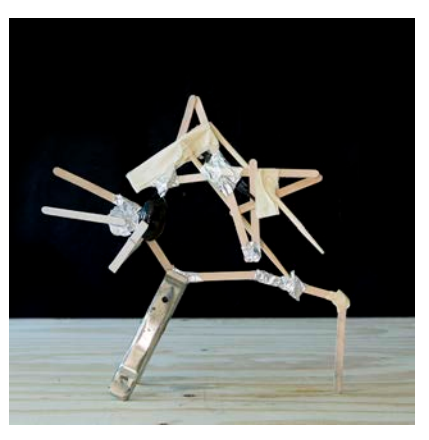
A Device for Removing Someone from Political Office