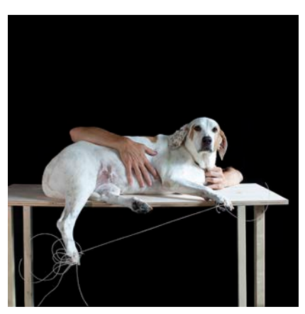
A Device for Being Funny, Not Frivolous