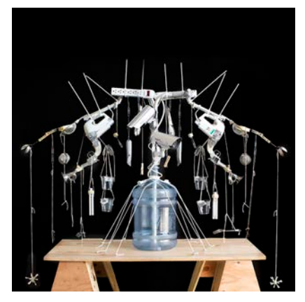
A Device for Integrated Principles