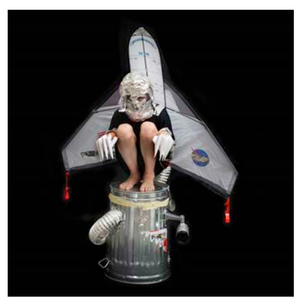
A Device for Awakening Creativity