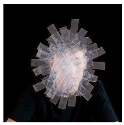
A Device for Interpolating Confidence