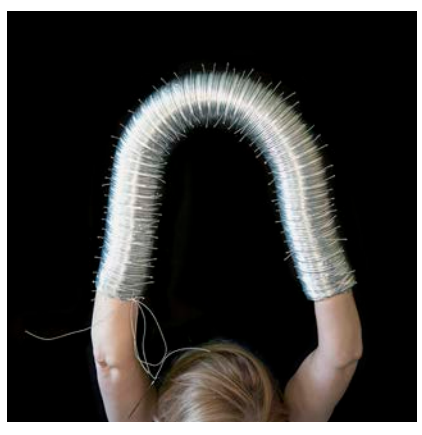
A Device to Get People to Like You