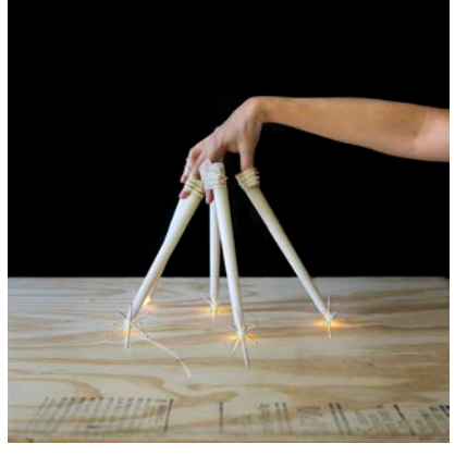
A Device for Emotional Intelligence