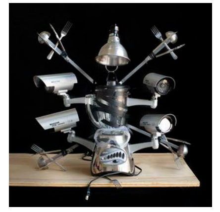
A Device for Transportation