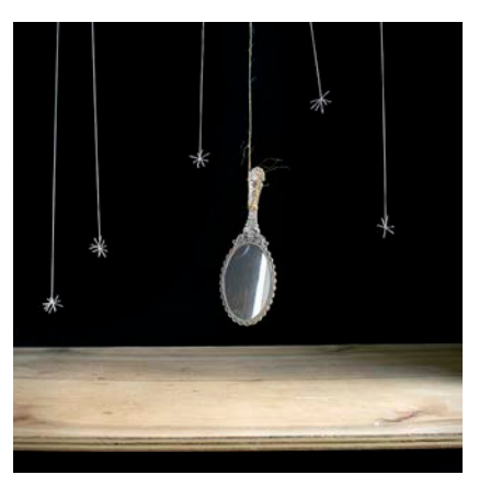
A Device for Saying Goodbye