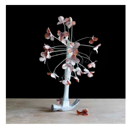
A Device to Forgive All the People Who Wronged You