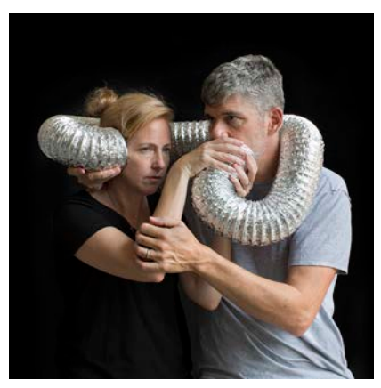
A Device to be Heard