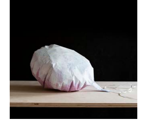
A Device to Die Peacefully