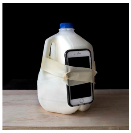
A Device for Extra Time