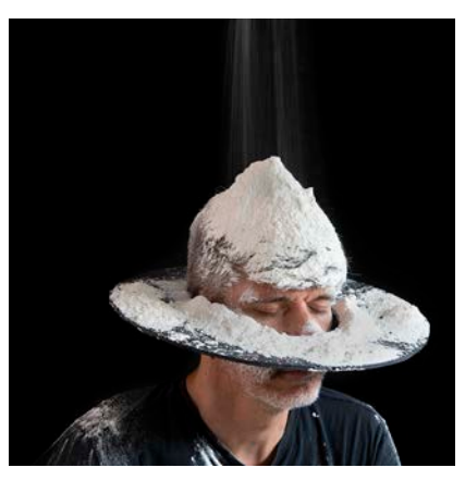
A Device for Temporal Disintegration