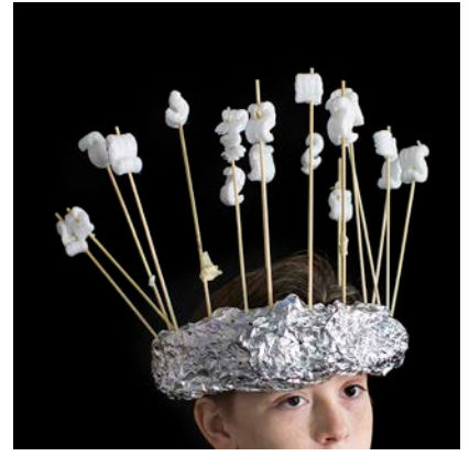
A Device for Compassionate Balance