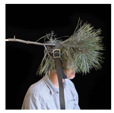
A Device to Talk with God