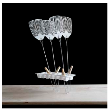
A Device for Reflecting the Mental Journey